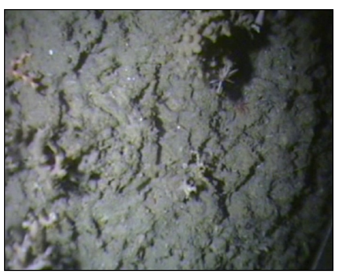
Figure 1 : Detail of retired coral carbonate mound showing coral rubble habitats distinct from off-mound habitats. Picture for a north Porcupine Bank coral carbonate mound, September 2008

Some coral carbonate mounds do not support live coral reefs, and typically have low abundances of filter feeding benthos. Research is at an early stage but it is thought that unfavourable hydrodynamic conditions at these so called 'retired mounds' cause limited food supply or excessively strong currents lead to erosion of the coral framework. While some of these retired mounds are in the process of being buried and covered by thick layers of sediment (De Mol et al. , 2005), others appear more speciose than surrounding seabed areas by offering distinct coral rubble and hardground habitats that in some cases is even more biodiverse than live coral habitats (Jensen & Frederiksen, 1992, Mortensen et al. , 1995). The sponge assemblage diversity has been negatively correlated with live coral cover (van Soest et al. , 2007). Hence, the absence of live coral reefs does not make coral carbonate mounds less significant in terms of conservation priorities.